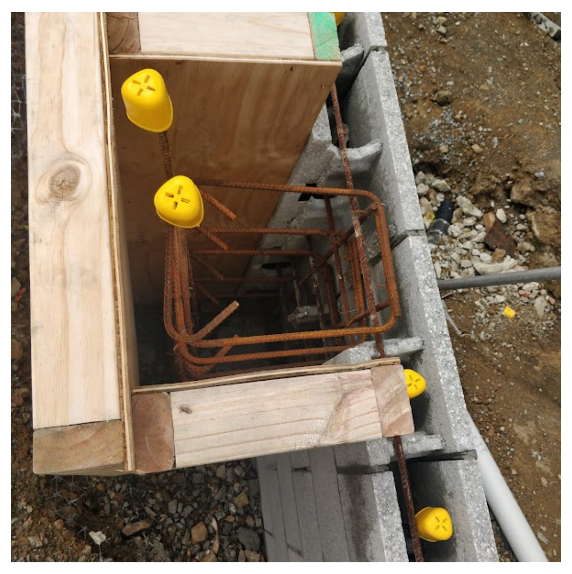
29/11/2021\ 10:00:00\ AMMasonry\ block\ column - 4/HD16\ with\ R10-200\ ties. Location as per plan