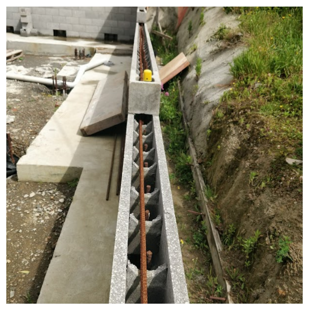
29/11/2021 10:05:00 AMTypical reinforcement detail as per plan