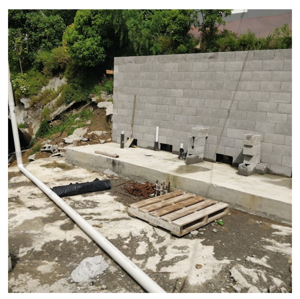
29/11/2021 10:05:39 AMGeneral block ports clean