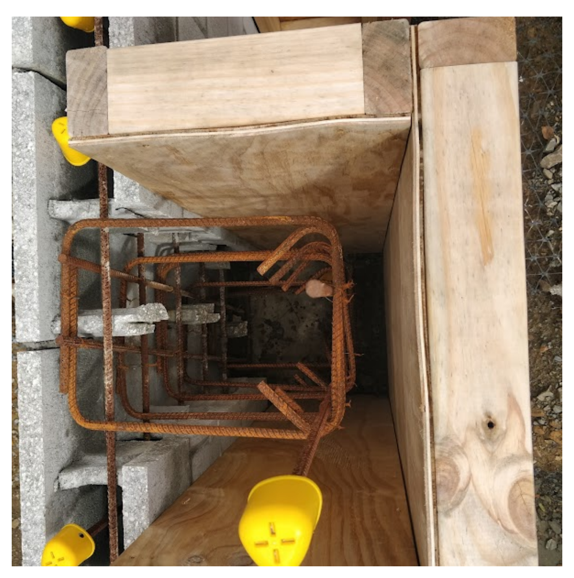
29/11/2021 10:00:00 AMMasonry column bars - as per plan