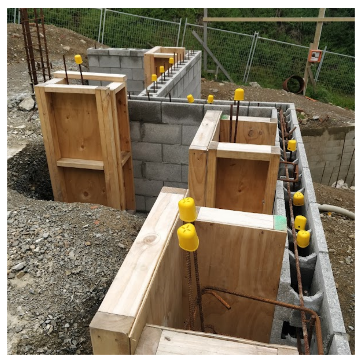
30/11/2021 10:00:00 AMBlockwall masonry column - location as per plan